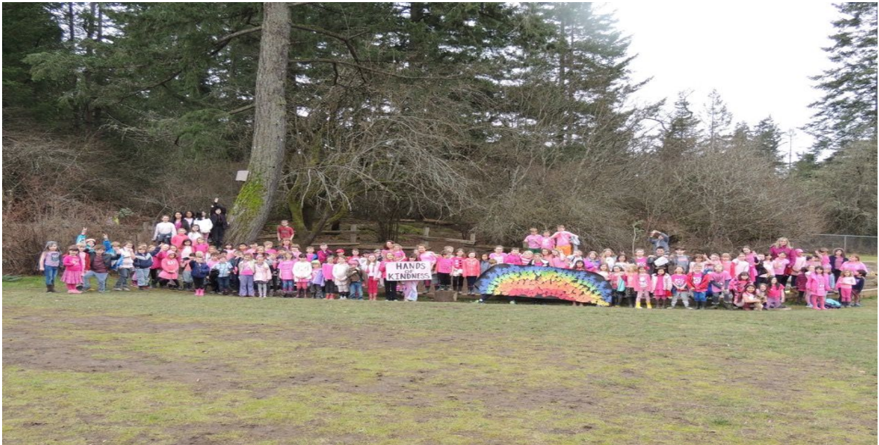
Hands of Kindness project Great showing of kindness on Pink Shirt Day